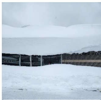
Loomis Lodge is hiding here somewhere

Praises: Sometimes the winters feel long. Shoveling snow can get old. It is during those times of shoveling, those times